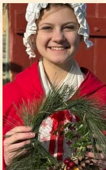
Hearth, Home & Springtime Saturday, May 9th